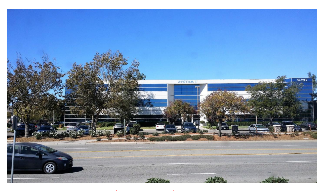
Student Catalog January 2020 — December 2021

E pluribus Universitatibus , Una ! 41707 Winchester Road #301 Temecula CA 92590